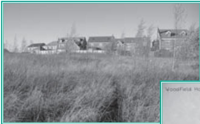
The land as it is now, viewed from New Lane playing field.

The parish council initially looked at the possibility of turning the land into a football pitch, with an on-site changing room to be added at a later date. But specialist consultants who were commissioned to carry out a feasibility study concluded that the proposal was a non-starter because: